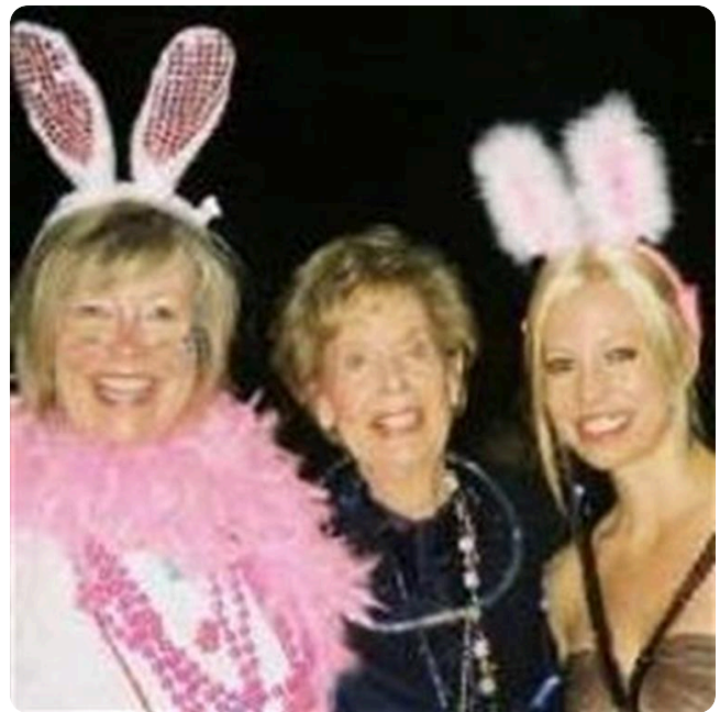
Mardi Gras Madness