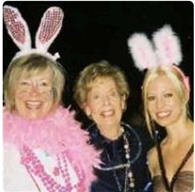
Mardi Gras Madness